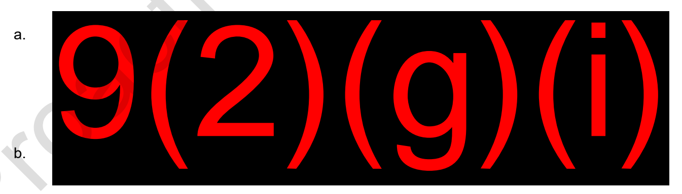
Agree / Disagree

The Ministry of Education recommends you: