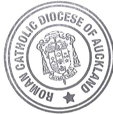
C A EMMETT Secretary Auckland